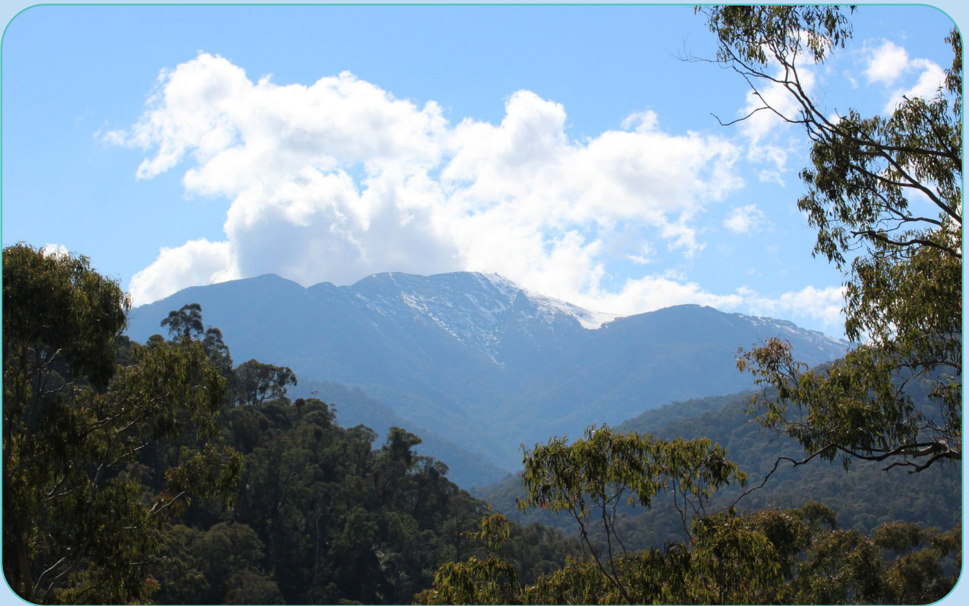
Mount Buller from the Howqua Valley