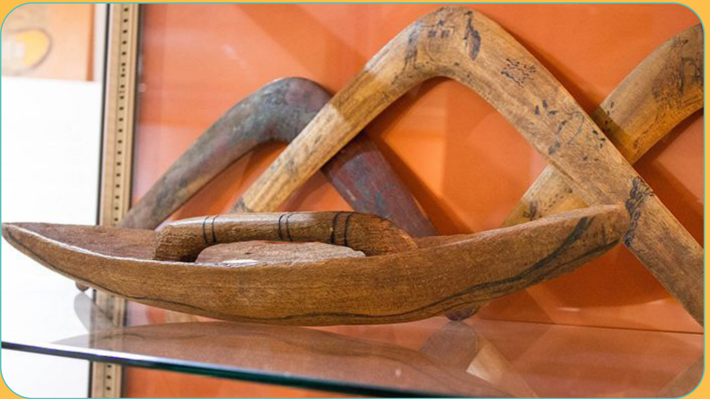
Krowathunkooloong Keeping Place